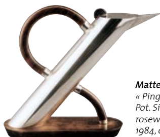
Matteo Thun « Pinguino » range Coffee Pot. Silver, boxwood, rosewood. Designed in 1984, crafted in 1988