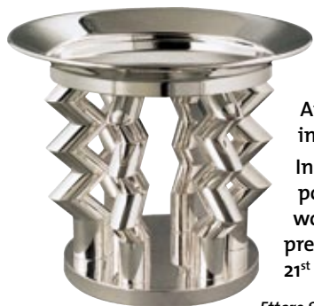
Ettore Sottsass - « Murransk » Cup - Silver- 1982

This floor houses an ensemble of gold and silverwork, ceramics and glasswork from 1950 to the present day. The collection was put together so as to bring perspective to and complement the museum's collection of objects from Antiquity, especially the 16 th to 18 th century gold and silverware which are exhibited in the second building.