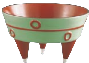
Olivier Gagnère Three-legged Cup. Arita porcelain 1992. FNAC loan