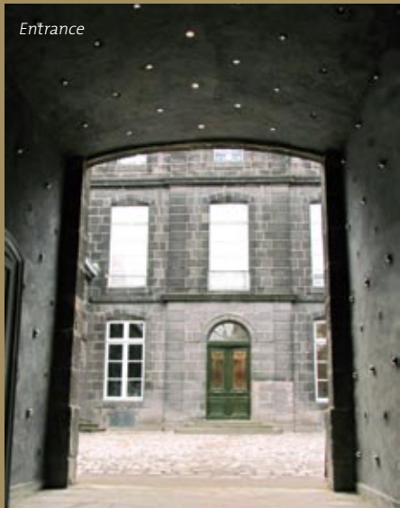
1 ST HOUSE GROUND FLOOR