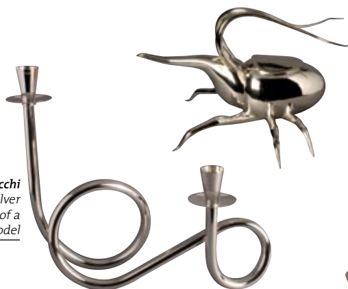
Mike Sharpe « Teapot Bug » teapot Silverplated copper 2003