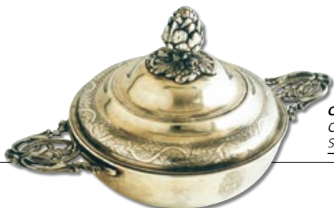
Covered Drinking Bowl Clermont-Fd Silver - 1781