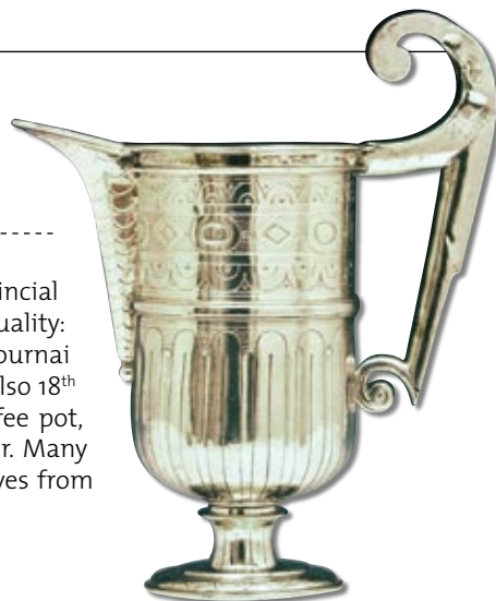
water pitcher - Spain - Argent Late 16 th century.

This collection is one of the most interesting to be housed in a provincial French museum. It includes some foreign pieces of exceptional quality: a late 16 th century Spanish water pitcher, a pair of 17 th century Tournai candlesticks, an Augsburg goblet from the 17 th century. There are also 18 th century Parisian and provincial works: Avignon ewers, a Dijon coffee pot, a Perpignan oil and vinegar set, a vegetable dish from Montpellier. Many Auvergnat pieces are displayed too: goblets, tasters, bowls and knives from Riom, Clermont-Ferrand, Saint Flour, Issoire, Thiers and Moulins.