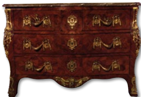
« Coffin-shaped » commode - 18 th century.

→ A description of the furniture on display is available in the room.